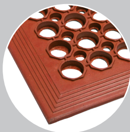
Terracotta (Grease Proof)