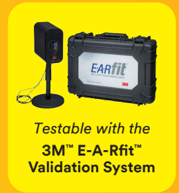
Testable with the 3M™ E-A-Rfit™ Validation System