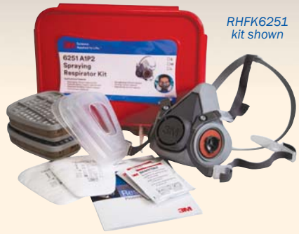
RHF6251 kit shown