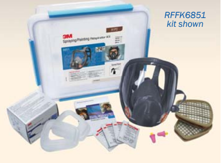
RFF6851 kit shown