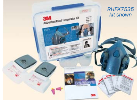
RHF7535 kit shown